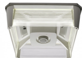
CREE IG LED CEILING MOUNT CANOPY

We removed over 100 outdated light fixtures in the parking garages and replaced them with new Cree IG LED Ceiling Mount fixtures. These new fixtures have a more pleasant aesthetic and create a bright atmosphere while using significantly less energy.