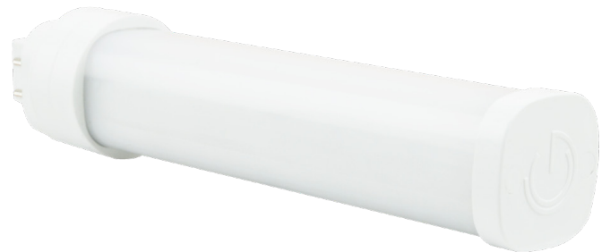
8.5W PLH DIRECT