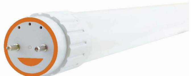
10.5W T8 DIRECT